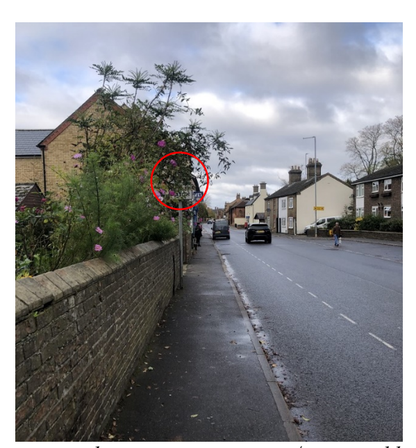
Image 3 – Vegetation obscuring existing sign / proposed location of TS4

Vegetation is currently obscuring the existing School sign (to TSRGD Diagram No.545). Under the scheme proposals the existing 'Patrol' subplate (also obscured) is to be replaced with a 'School' subplate. Obscuration of the proposed sign may result in road users failing to see / process the information conveyed and so unexpectantly encounter the hazard described by the sign. This could lead to sudden braking and/or collision with pedestrians (school children).