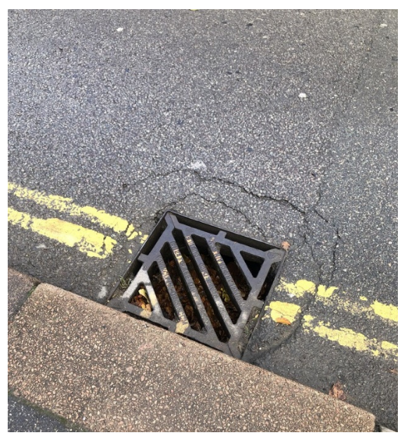
Image 5 – Carriageway defects surrounding partially blocked gully west of crossing (south side of B1042)

As noted in §3.1, no validated personal injury collision data / history was provided for review as part of the Stage 2 RSA submission. It is suggested that 5-year validated collision history records are interrogated to establish the nature of any PICs within the locality of the scheme and so inform the final detailed design (i.e. prior to the construction phase / scheme implementation). Validated collision data should be passed to the Audit Team for independent review.